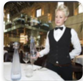
Served in the traditional manner

La Chapelle 35 Spital Square | London, E1 6DY | United Kingdom Phone: +44 (0) 20 7299 0400 | Fax: +44 (0) 20 7299 0401 www.galvinrestaurants.com